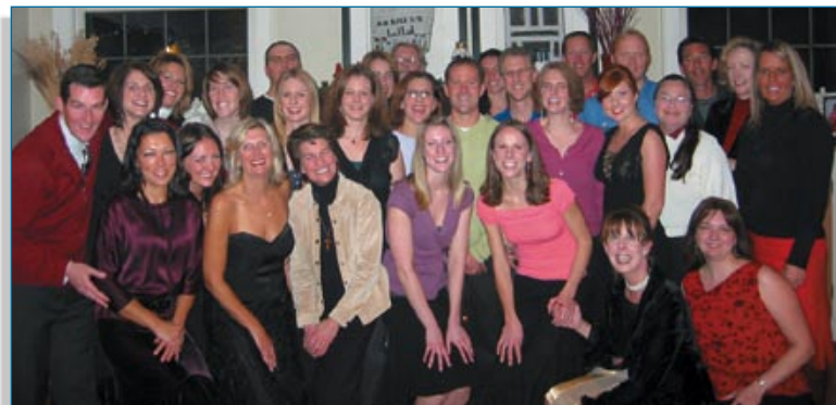
Staff, NW Sports Physical Therapy, Inc.

Osteoporosis and Osteopenia is a decline in bone mass and appears in about 50% of women in their 50s, 66% of women in their 60s, 86% of women in their 70s, and 93% of women over eighty. This loss of bone mass makes one more susceptible to broken bones and fractures. Your Physical Therapist can help you gain back some of your mobility and balance to help prevent falls and breaks. Your PT will teach you the correct exercises to build back your strength, and to increase flexibility and range of motion.